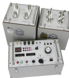
PCU1/E, LU500 and LU3000

Where higher currents and powers are required for primary injection, 7kVA and 20kVA primary injection systems are available. The PCU1/E and PCU2/E systems have separate control and loading units, allowing a wide range of load conditions to be covered with different loading units.